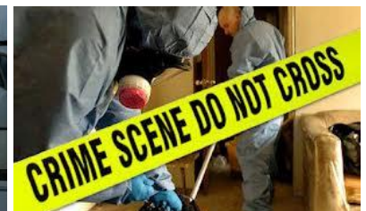
Accident & Crime scene cleaning