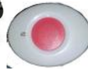
Multi purpose wireless alert system button