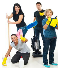
Offices and Household Cleaning