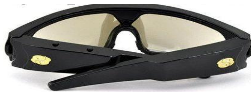
Undercover video and audio recording glasses. Available in sunglasses/other format