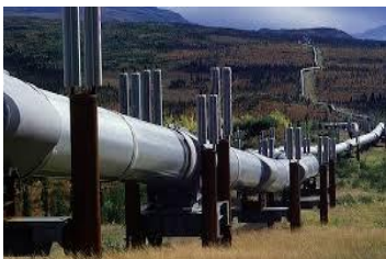
Pipeline undercover monitor system