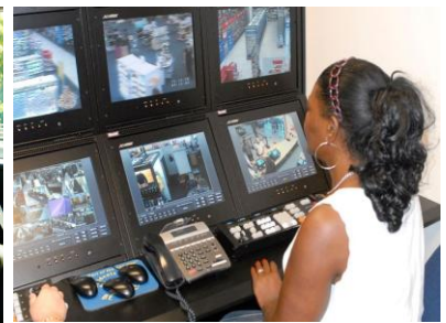
Surveillance monitor control room