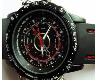
Undercover video and audio recording wrist watch Available in different designs and colors.