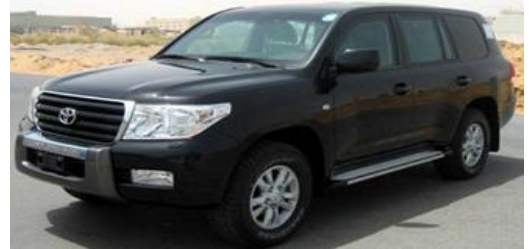
Bullet proof vehicles of various brand