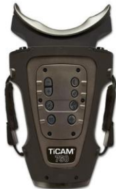
Thermotechnic thermal night vision