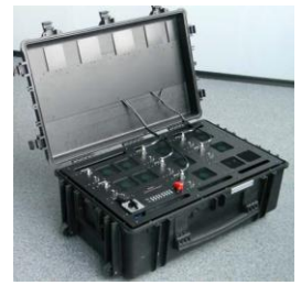
Suicide bomb detector