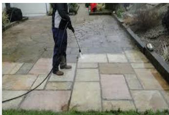
Environmental cleaning and Fumigation