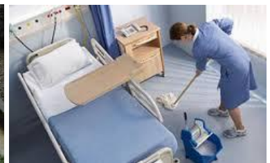
Hospital & Health facility cleaning.