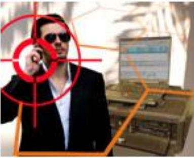
Portable 3G IMSI Catcher. Ideal for surveillance, Monitoring/interception