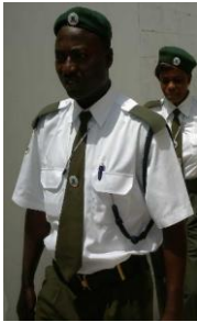
Male & Female Guard & V.I.P Escort Bodyguard